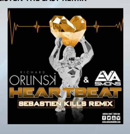
AND THE LAST TRACK