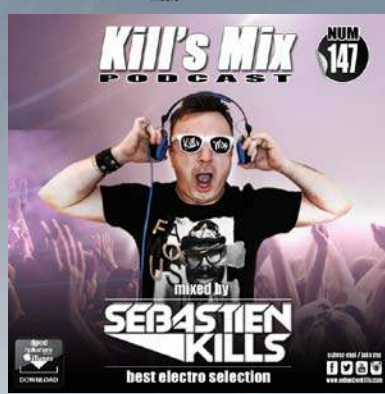
LISTEN TO KILL'S MIX SPECIAL HAPPY NEW YEAR – 3H OF MIX